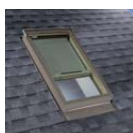
Solar battery lightblock shade